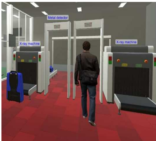
Fig. 4. Screen form of the Red Channel.

the student enters into dialogues with the staff. At the same time, some phrases in the dialogues are skipped and the student is offered to choose the necessary lexeme in accordance with the rules of the foreign language and the semantic load. In this case, the system indicates to the operator and the student the correctness of the chosen answer option. All answers are fixed by the system and on the basis of these data, the training system "Virtual Customs" evaluates the student.