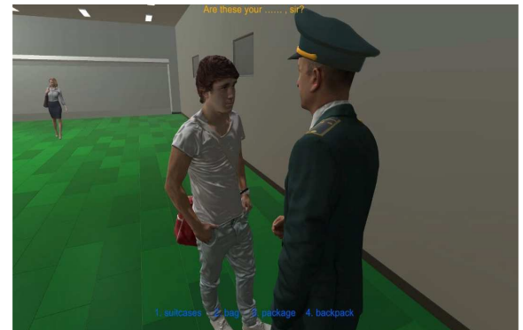
Fig.3. Screen form of the dialogue with missing words

In the "Red Channel" hall, for example, the student can get acquainted with the names of the customs equipment, study the customs declaration, prohibited items list and other documents. For that, it is necessary to proceed to this room and "approach" to the specified objects. Screen forms with examples of described items are shown in Figure 4.